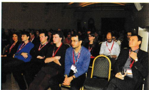
Opening Session in the Refter room.

The three parallel sessions started after the morning coffee break with the High Performance Separations being well attended. Oral presentations were given on: