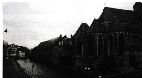
Picture of the rear of Het Pand, the venue for HTC-14.

The location for HTC-14, Ghent is a historic city in north-west Belgium, with roots back to the Middle Ages, and sits at the junction of the Leie and Scheldt rivers. Today it's a university town and cultural hub with a cobbled pedestrian zone centre known for medieval landmarks such as 12th-century Gravensteen castle and the Graslei, a row of guildhalls beside the Leie river.